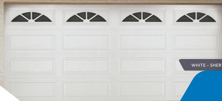
WHITE - SHERWOOD WINDOW